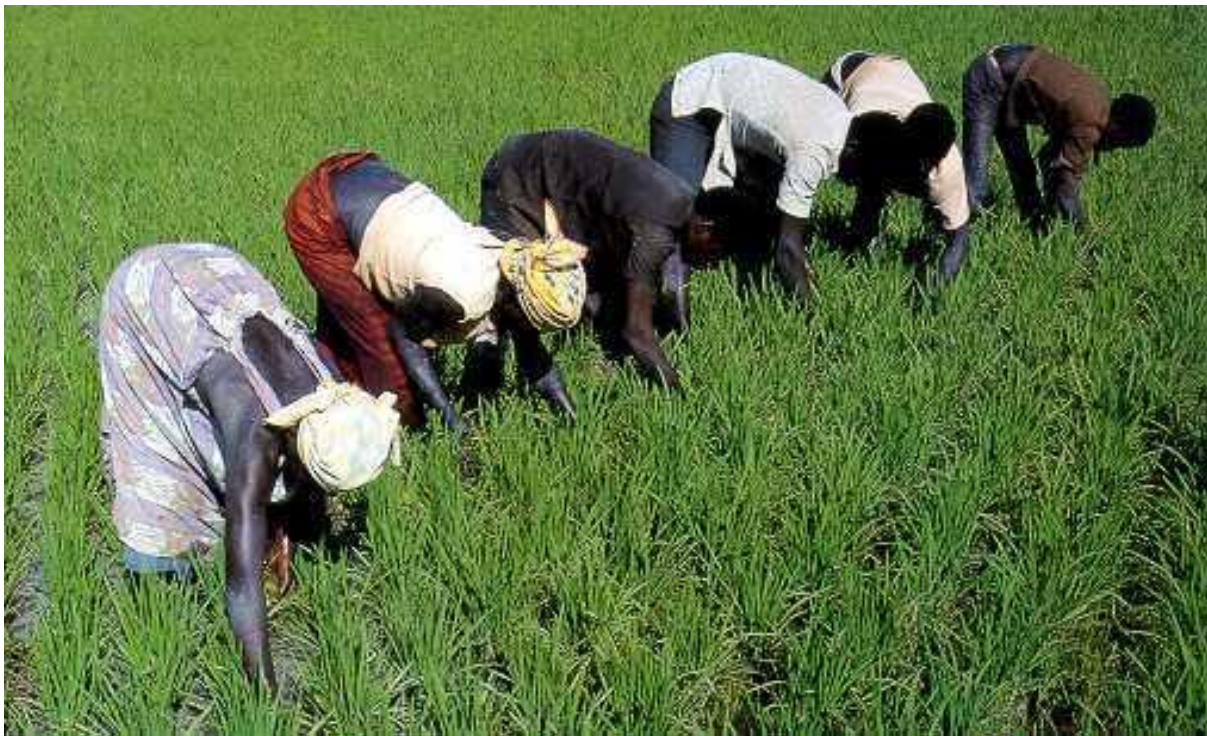
Figure 4: Lowland rice smallholder rice farming in Saukoko areas, Liberia

The Comprehensive Assessment 9 of the Agriculture Sector prepared by Liberia's Ministry of Agriculture 10 suggests that Liberia's agriculture is reported that, rice is the main staple food, followed by cassava and other food crops. Production data for rice in particular and other crops is lacking, though for 2017, FAO estimates that, overall rice production outlook was favorable with preliminary estimates aggregate paddy production at about 275,000 tonnes which was about 2% above the previous year's output and slightly below the five-year average 11 . Upland rice cultivation is more prevalent, with 63% of producing households using this method of cultivation, as compared to 17% of households using and swamp rice cultivation methods (the rest, 21% of producers, combine both techniques). Upland cultivation is prevalent in RiverCess, Grand Kru and Nimba, while swamp rice is mainly cultivated in Lofa County. Even in swamp or lowland areas (Figure 5), productivity or yields per hectare are often low, and well below that of neighboring countries, and in the country as a whole, locally produced rice is used mainly for household consumption.