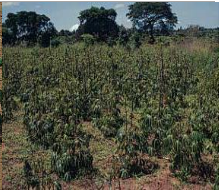
Figure 2: Severe CMD in an initially healthy planting of cassava 8