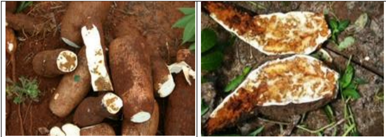
Figure 3: Cassava Tuber Necrosis caused by Cassava Brown Streak