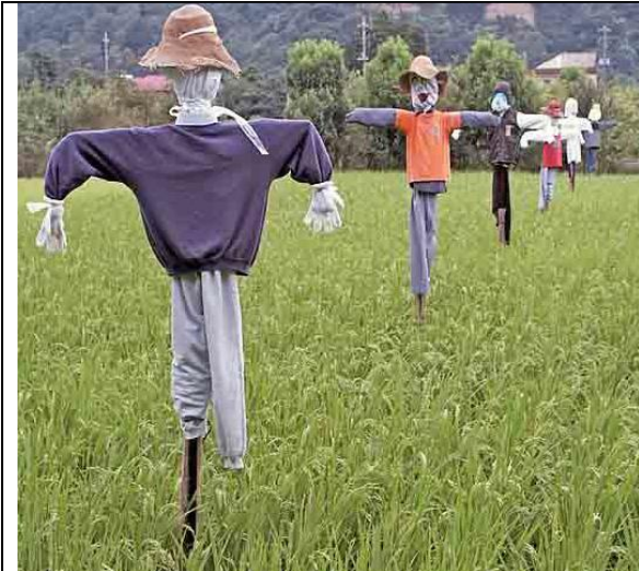
Figure 9: Scare crow in a rice fields.