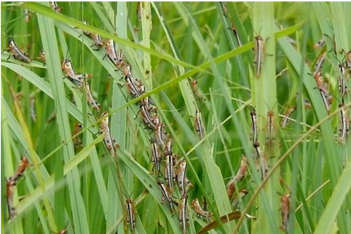
Figure 8: Section of locusts swarming on rice fields

During periods with favorable weather, locusts multiply rapidly and form large swarms that can cause huge damage to plants in a very short period of time. Grasshopper has become increasingly damaging on cereal crops especially maize and rice in parts of the country (Figure 9). There being no tangible research currently on the management of the pests in rice fields in the country, farmers reportedly use any available insecticide whenever outbreaks occur.