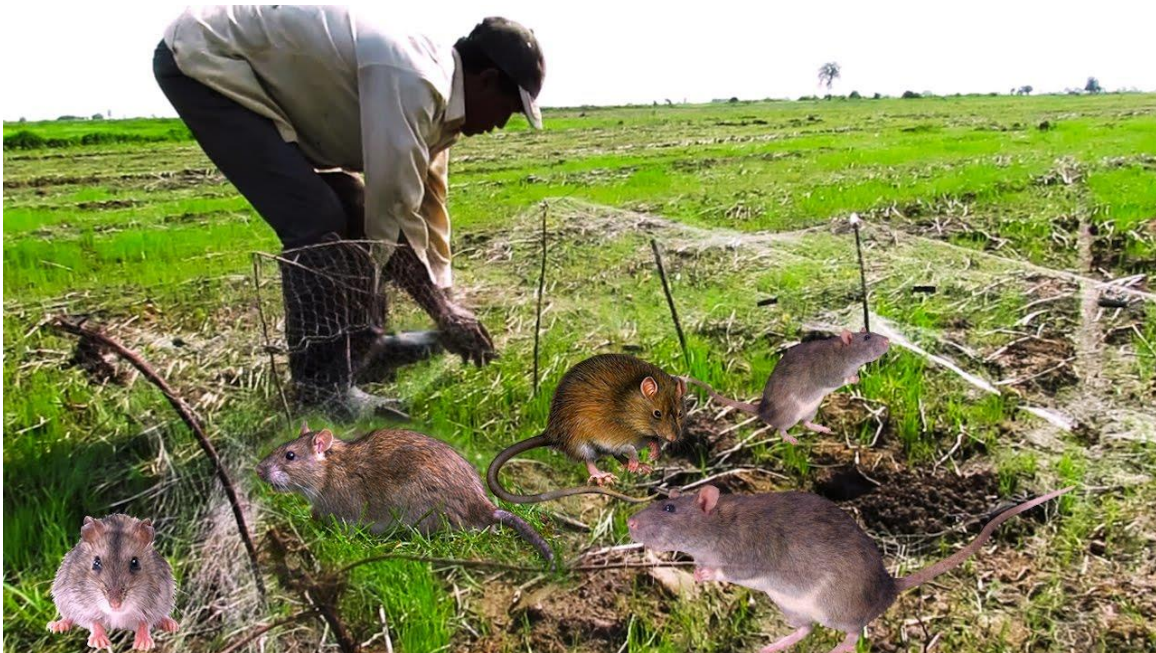
Figure 5: A mazing catch of rats using net traps in a rice field