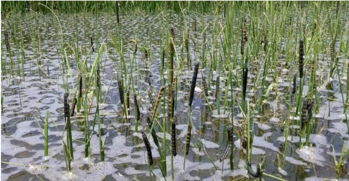
Figure 6: Infestation of Army Worm in recently transplanted rice field

crops (maize, rice, sorghum and millets) as well as pasture (grass family) and therefore a threat to food security and livestock. The problem with armyworms is that they are highly migratory so that larval outbreaks can appear suddenly at alarming densities, catching farmers unawares and unprepared. The worms destroy crops in the grass family like maize, rice (Figure 7) and millet and in addition, animals that feed on infested pasture get bloated and can even die. Currently these are mainly controlled through use agro-chemicals by the farmers.