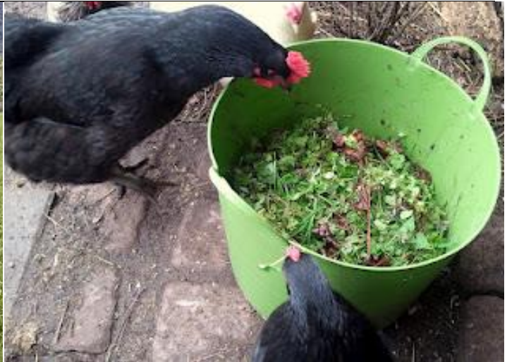
Figure 10: Chicken being local herbs to treat coccidiosis in Lofa areas in Liberia