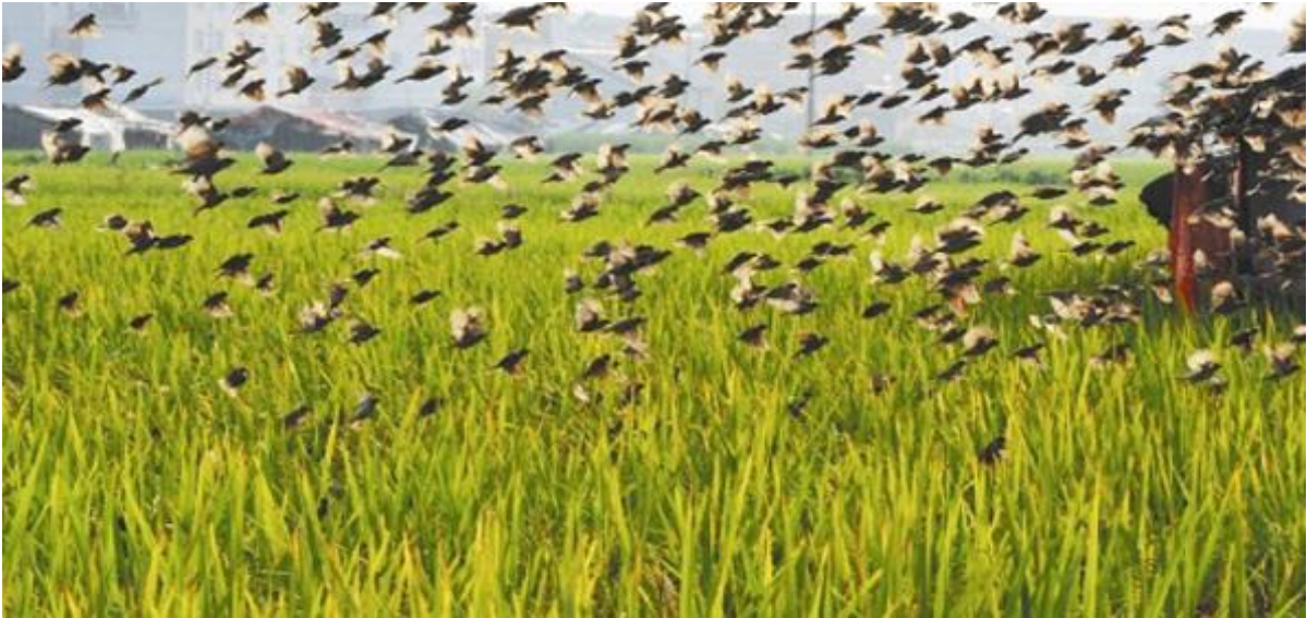
Figure 7: Swarming Birds in rice fields