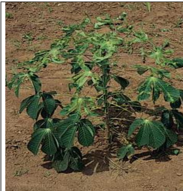
Figure 1: Severely affected cassava grown from a healthy cutting and subsequently infected during growth by Viruliferous whiteflies 7

Cassava brown streak disease (CBSD) is another viral disease transmitted by the white fly and causes serious economic losses in the yield and quality of the roots (Alicai et al. , 2007). Especially in susceptible varieties, infestation renders the roots unusable particularly when left in the ground for longer periods. CBSD symptoms are observable on the leaves, stems and roots however; on the leaves, the symptoms are more prominent on older leaves than young ones. Unlike CMD, infected leaves do not become distorted. The characteristic symptom on the leaves appear as patches of yellow areas mixed with normal green color which may enlarge and join to form comparatively large yellow or necrotic patches. These yellow patches are more pronounced in mature than young leaves. On the stems, the disease appears as dark brown streaks and spots and is more prominent on the upper green portions of the stem. On the roots, the disease causes cracks, discoloration, root constriction and malformation. The harvested roots are corky with yellow-brown necrotic spots. The cassava green mite ( Mononychellus tanajoa ) is a spider mite, which causes serious infection on cassava. It feeds on young leaves and green stems and can easily be confused with effects cassava mosaic disease.