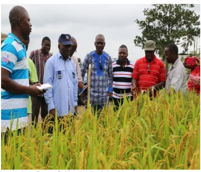
Inspection of a rice field CARI Liberia

Table 1, indicates that the majority of the certified rice seeds procured by Sierra Leone and Liberia were from Burkina Faso. Liberia made a considerable purchase from Guinea. Togo and AfricaRice provided foundation rice seeds to both Sierra Leone and Liberia, whilst additional foundation seeds were procured for Sierra Leone from Nigeria. Niger was the sole main provider of cowpea seeds, whilst small amounts came from Ghana. Certified maize was provided by Burkina Faso, Senegal Ghana and Nigeria.