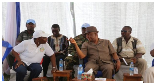
The Vice President of the Republic of Liberia at the seed reception ceremony

Handling of the improved and certified seeds they are to receive. Other speakers were the Acting Minister of Agriculture, the Chair of the Agriculture Committee in the Representatives. Deputy Ministry of Finance and