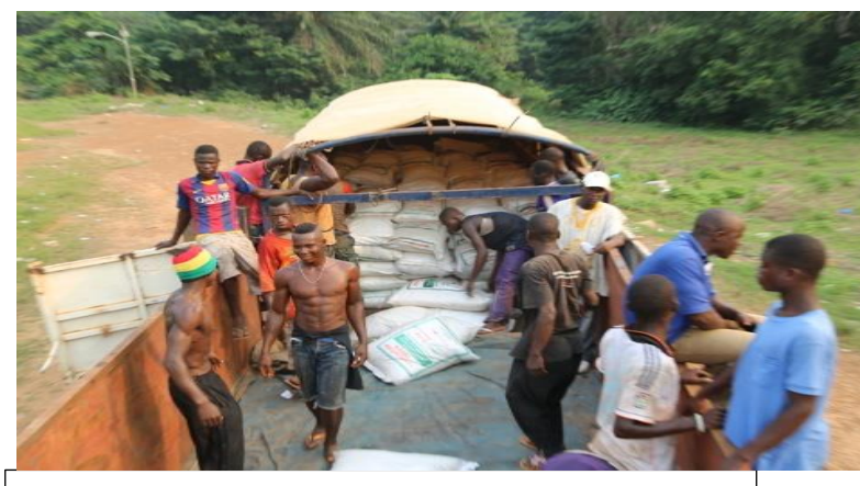
Off-loading of rice seeds at the Guinea/Liberia border

So as to facilitate the free movement of seed trucks, routes were planned well in advance. ECOWAS authorized border custom services and control to facilitate the smooth movement of the trucks. The movements of the trucks were monitored in real time using an instant messaging system (SMS), e-mails and telephone communication between the CORAF /WECARD, West Africa Seed Program (WASP) Coordinator, WAAPP National Programme Coordination Units, and the relevant authorities of countries either sending and receiving seeds. The communication was particularly robust at the border. For Sierra Leone and Liberia, seeds were sourced from eight countries, based on the ecological similarities of the upland and lowland varieties of seeds purchased. In the case of Guinea, rice seeds were purchased from Cote d'Ivoire, whilst other varieties were sent from areas of surplus production to areas in the country with a production deficit.