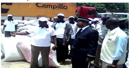
Prefect Kankan and Senior Government officials at ceremony to send seeds to Liberia

A ceremony was held in Kankan, Guinea to mark the sending of seeds to Liberia. In his statement before releasing the seeds the Prefect of Kankan acknowledged the sisterly ties between the two countries and wished Liberians well in their road to recovery of the agricultural sector. Other senior Government representatives were present at the ceremony.