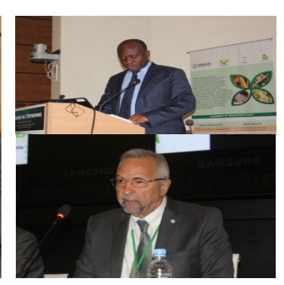
AfDB, USAID/WA and the World Bank were at the Launching