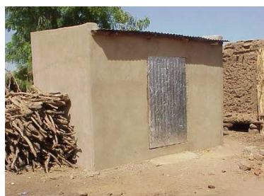
One room attic (5 months storage in very good condition)