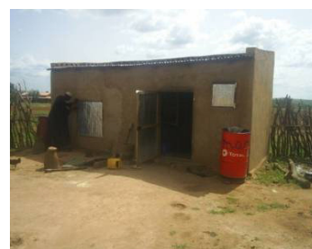
Double room attic ( Accumulation of smoke creates hostile environment for peanut stored pests)